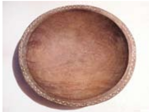
Figure 3. One of the two types of bowl collected by Bellamy from Kiriwina, South East Division, in 1915 photograph by S Schaffarczyk, 2005

The employment of FE Williams in 1922 as a permanent Government Anthropologist saw a slightly more organised approach to recording information pertaining to each collected object, and saw collecting